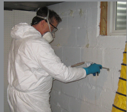
IMPOSSIBLE APPLICATIONS NOW POSSIBLE

2775 Barber Road PO Box 1078 Norton, Ohio 44203 USA p: 1 330.753.4585 1 800.321.5585 f: 1 330.753.5199 info@fomo.com www.fomo.com