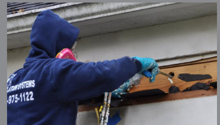
INDUSTRY FIRST TECHNOLOGY

High Flow Technology delivers what other polyurethane foams can't, filling cavities more efficiently, more effectively and more completely than any other building material.